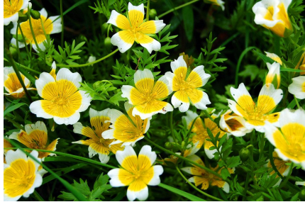
Poached egg plant